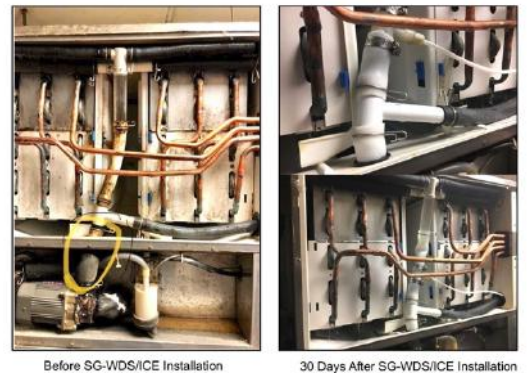
5 Star Hotel before and 30 days after installing SG-WDS/ICE