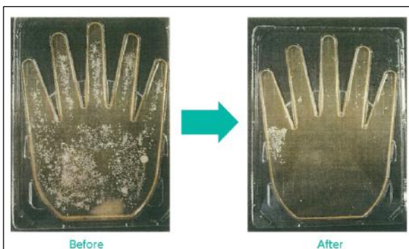
Bacteria on hands before and after washing with 5 PPM ozonated water for 5 seconds

As shown above, a 1 second exposure to Ozonated water with just a 2 PPM ozone concentration will kill 99.99% of all E.coli bacteria on a surface.