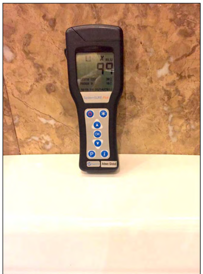
AFTER APPLYING OZONE WATER THE BACTERIA COUNT IS JUST 99