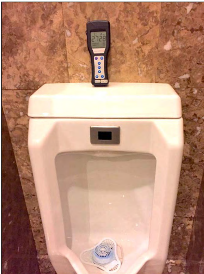
BEFORE APPLYING OZONE WATER THE BACTERIA COUNT WAS 2728