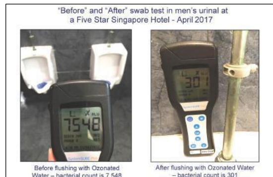
Swab test results