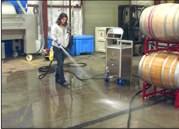
Surface disinfection with Ozonated Water