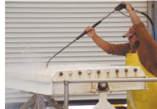
ALL SURFACE CLEANING