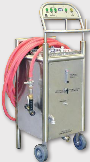
Hose and wash gun not included