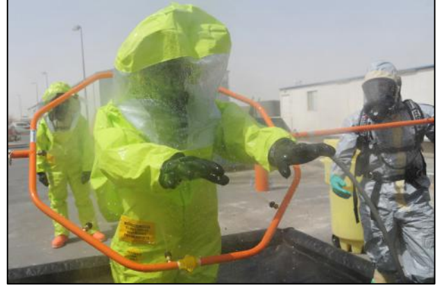
HAZMAT Decontamination with Ozonated Water

The ProMedUSA Model SG-C2 Mobile Disinfection Cart provides highly concentrated ozonated water (up to 16 ppm of dissolved Ozone) for General Surface Disinfection, Cleaning and Civil Defense HAZMAT Response. It is manufactured in the USA for ProMedUSA by ClearWater Tech Ozone in California.