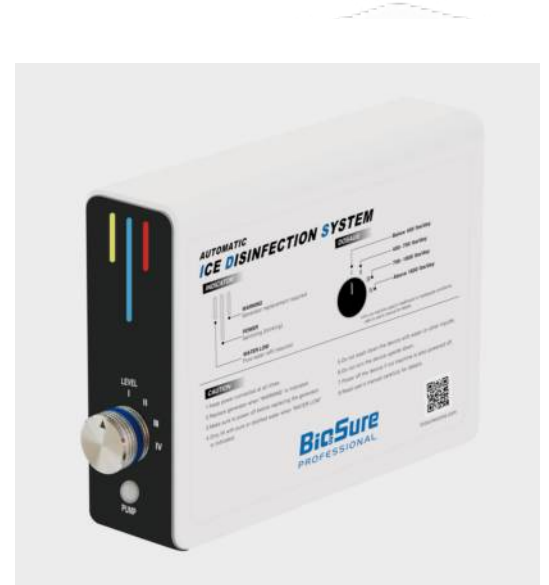
Model SG-IDS certified by SGS, CE TUV Rheinland and Campden BRI

IDS ensures IDS provides best quality hygiene to ice and ice makers any time and every time. # Ensuring ice hygiene can never get more simple and confidence.