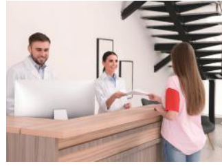
Hospitals & Clinics