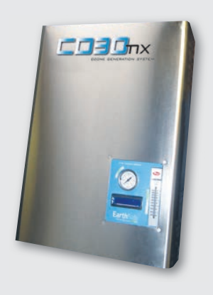
CD30nx Ozone Generator