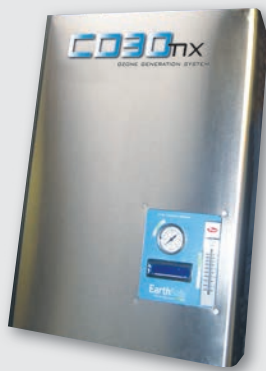
CD30nx Ozone Generator