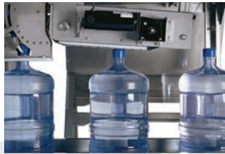
BOTTLED WATER FILL LINES