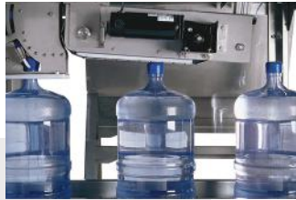
BOTTLED WATER FILL LINES