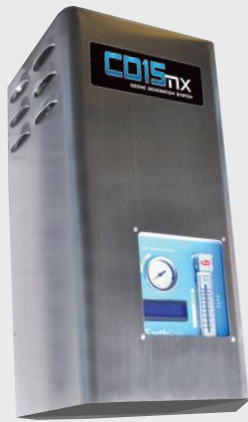
CD15nx Ozone Generator