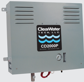
CD2000P Ozone Generator