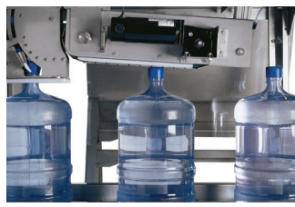
BOTTLED WATER FILL LINES